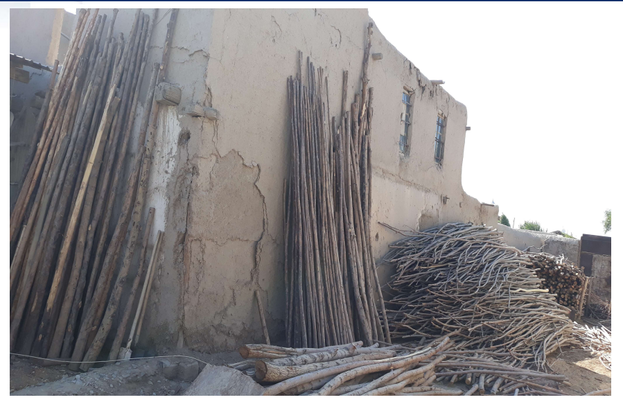
Figure 2. View of the inner courtyards of old houses