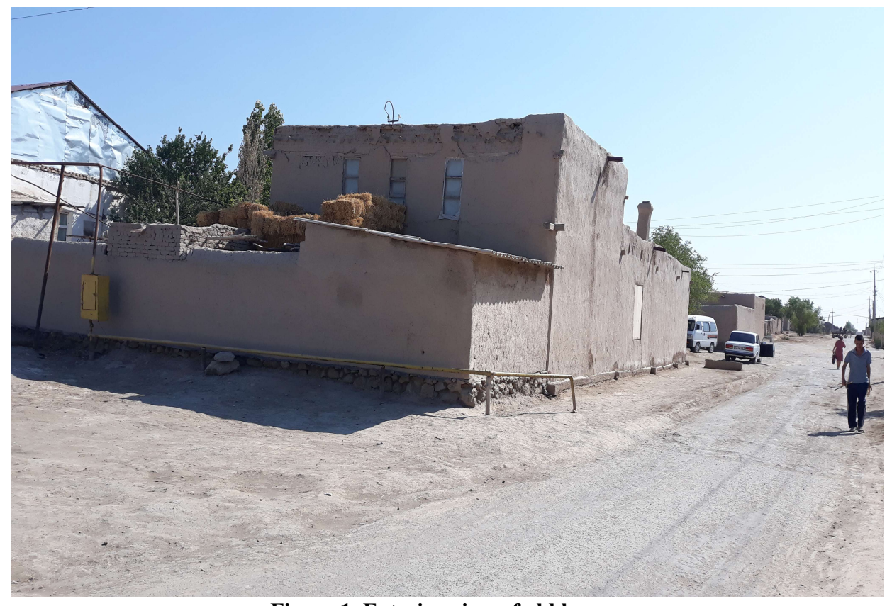
Figure 1. Exterior view of old houses