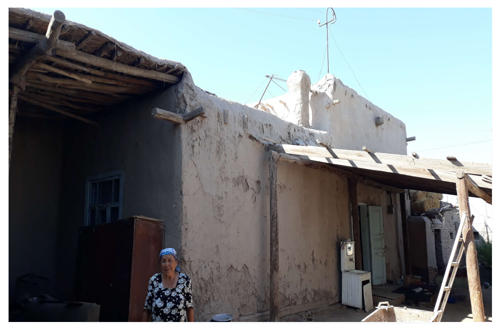
Figure 6. View of the inner courtyards of old houses