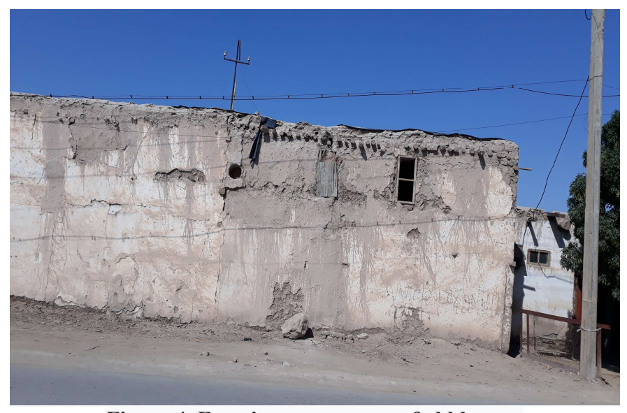
Figure 4. Exterior appearance of old houses