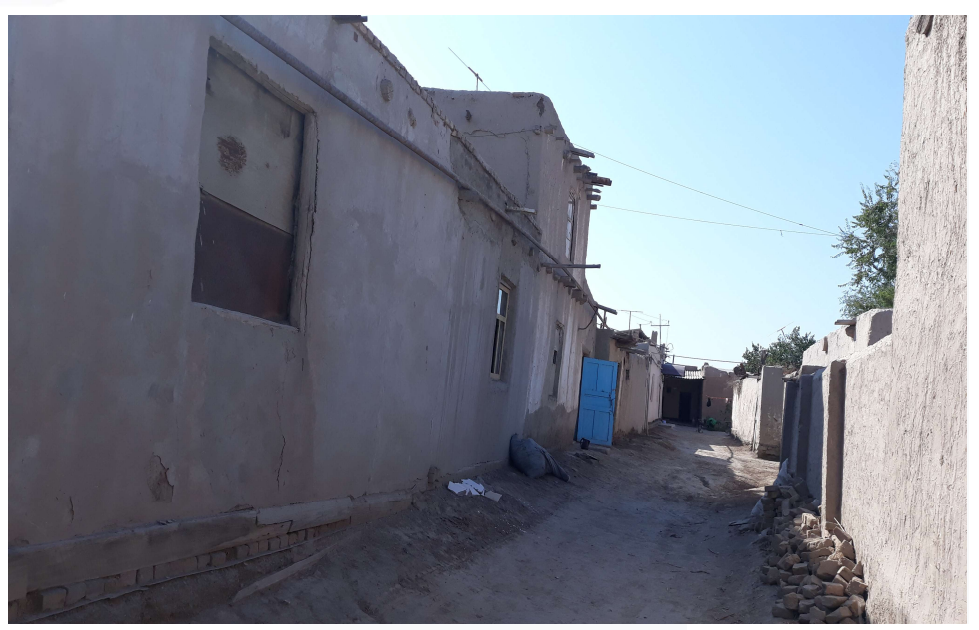
Figure 5. The old city skyline